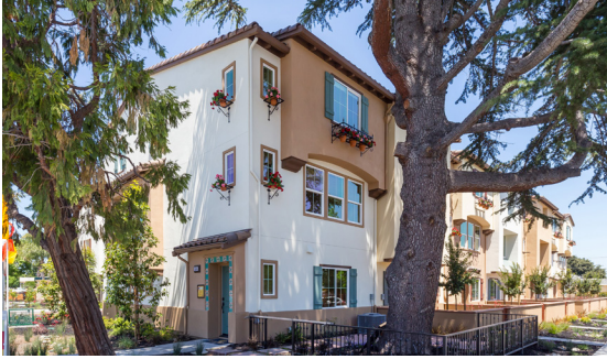
▲ Actual home for sale ▼

423 E. Maude Avenue, Sunnyvale Saturday, August 5 at 10:00am